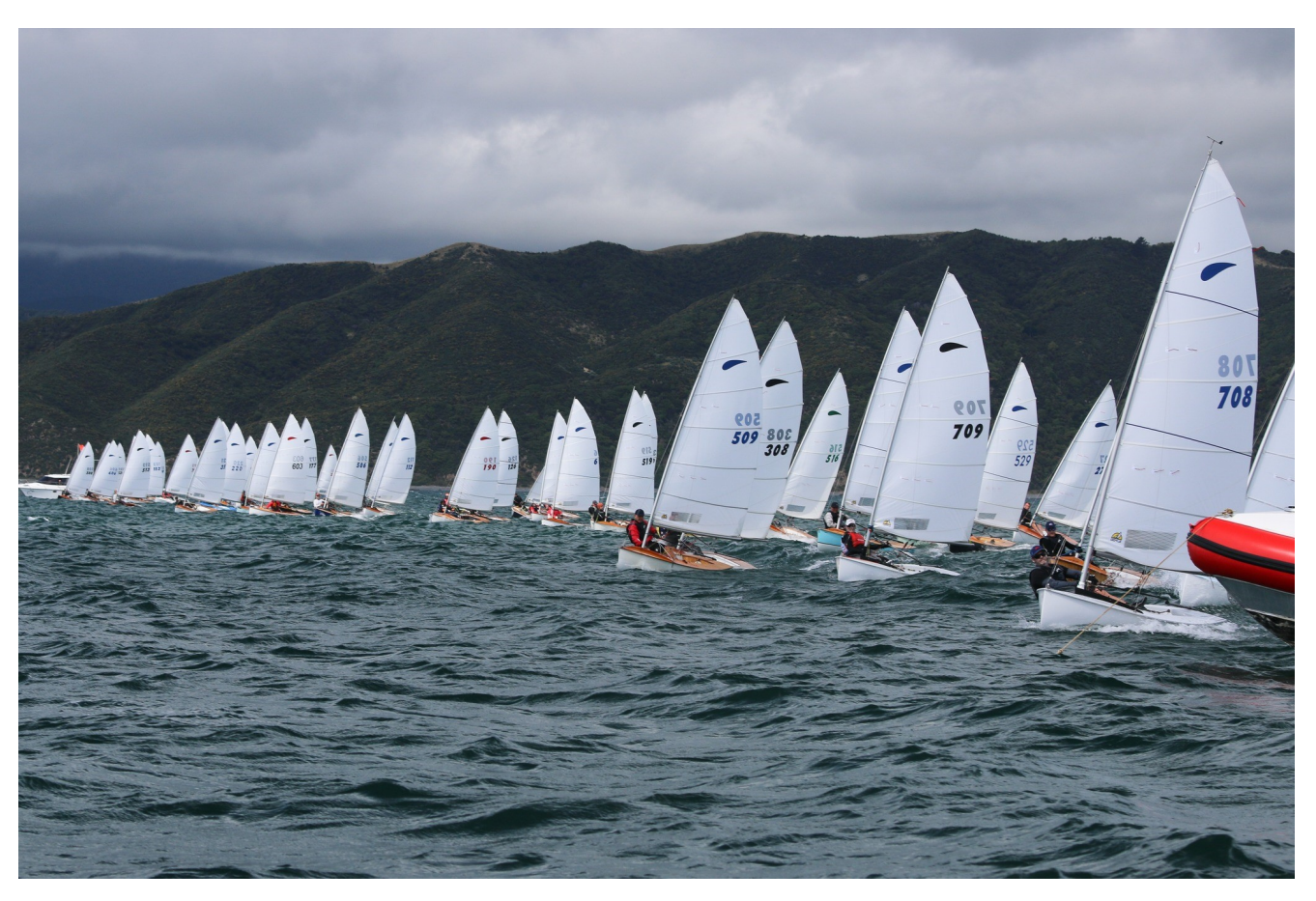
▲ Race three start at the 2023 Wellington Nationals.