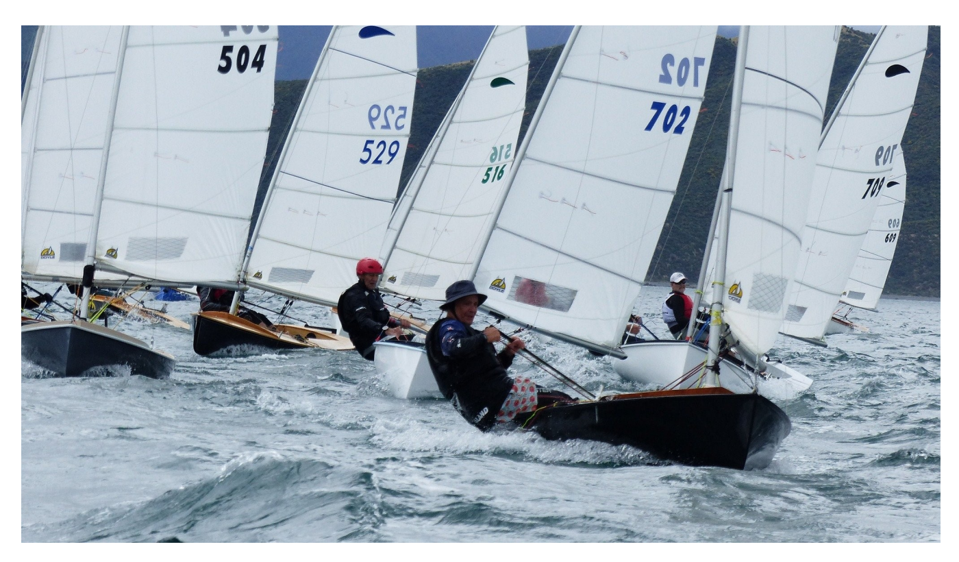
▲ A crowded top mark rounding could be alternately titled, 'Fashion police give chase to miscreant wearing red polka -dot trousers!'