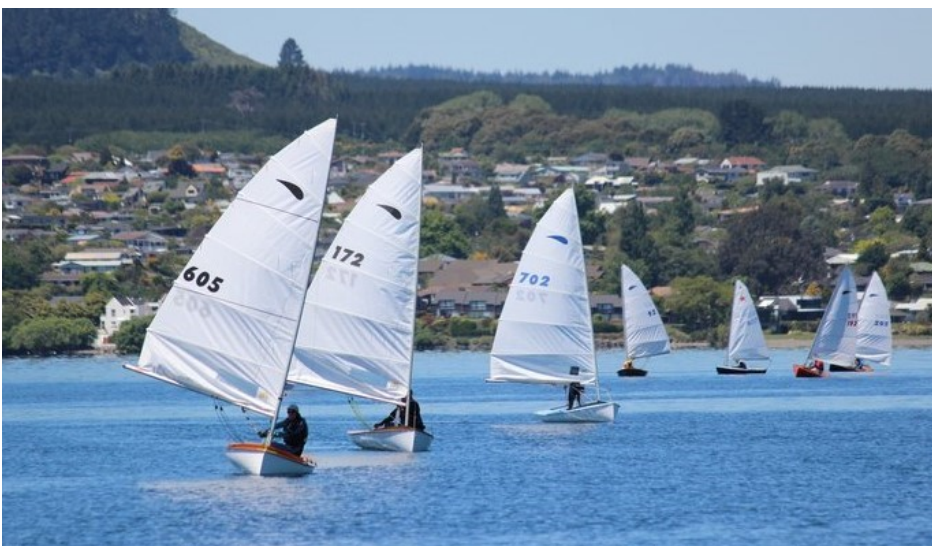
◀ A gaggle of Zephyrs chasing invisible wind zephyrs on day one, 2023 North Island Champs, Lake Taupo.