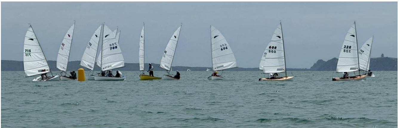
▲ Lap one race one 2025 Auckland Champs