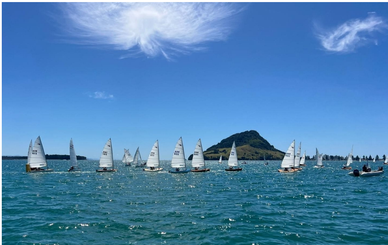
▲ Even the clouds decided to put on a show for the Zephyr nationals. Creative cirrostratus with a flare for shape.