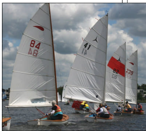
Zephyr/Mistral Weekend action!