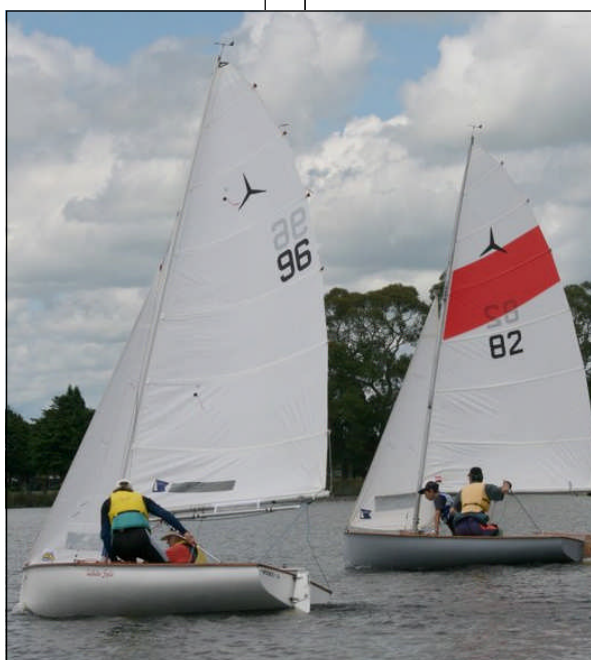
Zephyr Weekend Mistral Action!