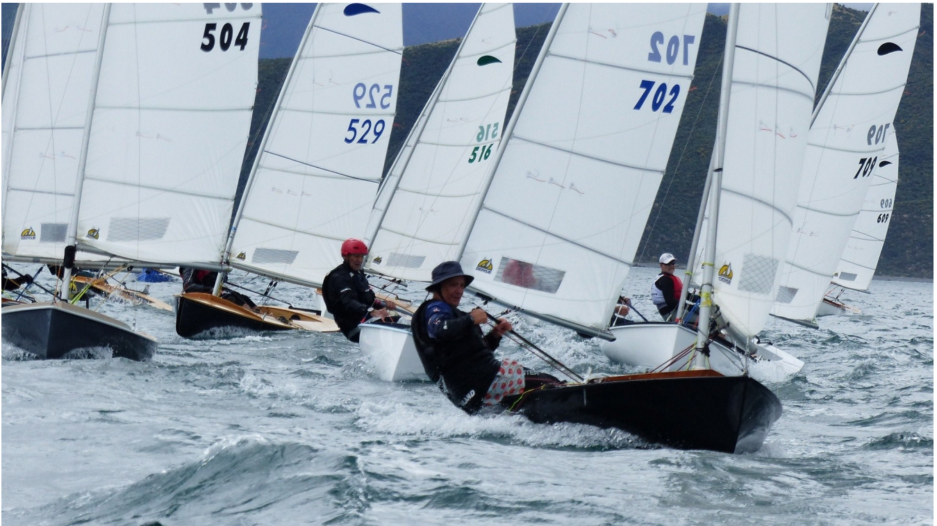
▲ A crowded top mark rounding could be alternately titled, 'Fashion police give chase to miscreant wearing red polka-dot trousers!'